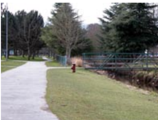
South Arm Park