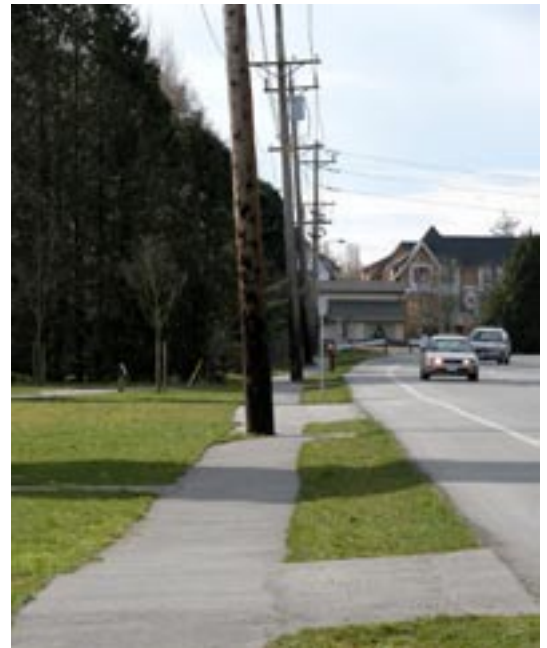
Garden City at Cook Road (looking south)

The Kit of Parts, established through the Beautification Strategic Team, has identified different greenway links and associated design criteria for Garden City Road. A number of large residential redevelopments are occurring along Garden City Road in the McLennan areas that will be responsible for constructing sections of this greenway as per the McLennan North Sub-area Plan and Kit of Parts. The potential ownership and land use designation of the DFO lands (also referred to as MoT lands) is under review. Alderbridge Way is a proposed cycling route and greenways that will connect to the Shell Road Greenway and the Nature Park. Garden City Road is presently being constructed north of Sea Island Way with the intention of extending it to River Road. Public art at the intersection of Garden City Road and Sea Island Way will reinforce this area as a ‘gateway’ into Richmond. Pedestrian and cycling links to Oak Street Bridge are being considered for the north side of Sea Island Way. The former Bridgeport Market site is being redeveloped with public waterfront access along the North Arm of the Fraser River.