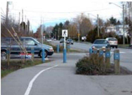
Cycling path on Garden City (south of Francis Road)