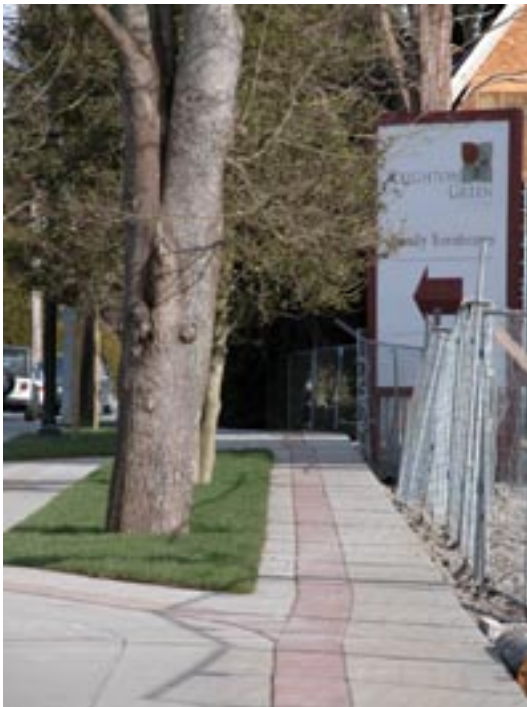
New sidewalk treatment on Garden City, looking north from General Currie Road