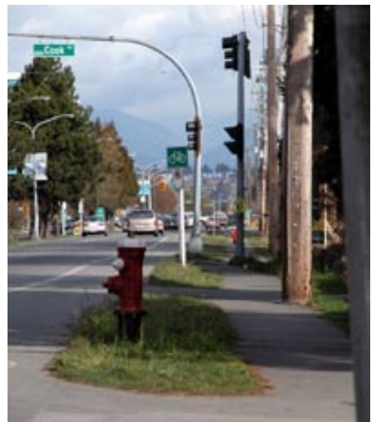
Garden City at Cook Road (looking north)