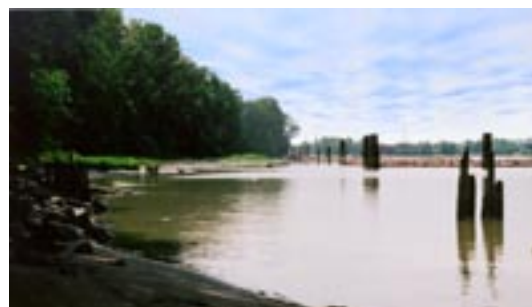
North Arm Fraser River