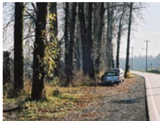
No. 9 Road Fishing Bar