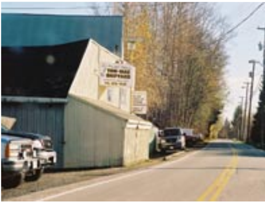
River Road industrial use