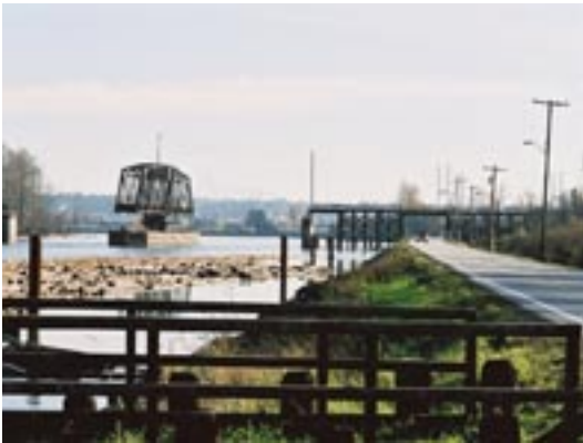
CNR swing bridge