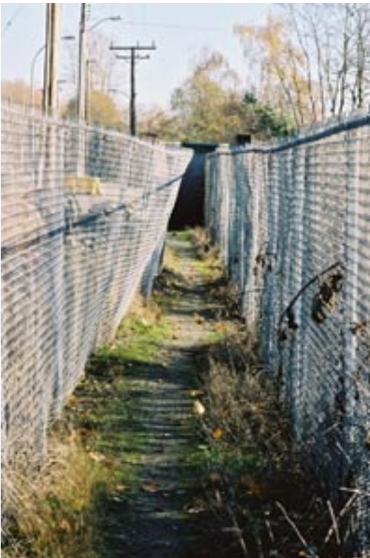
Public access through Richmond Plywood