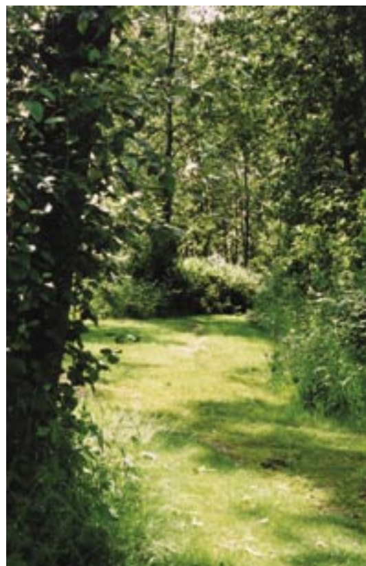
No. 7 Road Pier / Park