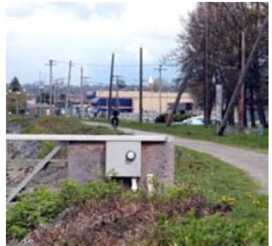
Middle Arm Trail (near Cambie Road road end)

The Waterfront Development Strategy will focus on the economic, recreational, and aesthetic importance of the City Centre waterfront and development strategy to create a significant urban waterfront. Planning for a major Rapid Transit Project (RAV) connecting Richmond, Vancouver and the Airport is underway. Large areas that may be undergoing significant land use change include Department of Fisheries and Oceans lands (135 acres), the West Bridgeport area to the north, and sections of the West Cambie’s residential area.