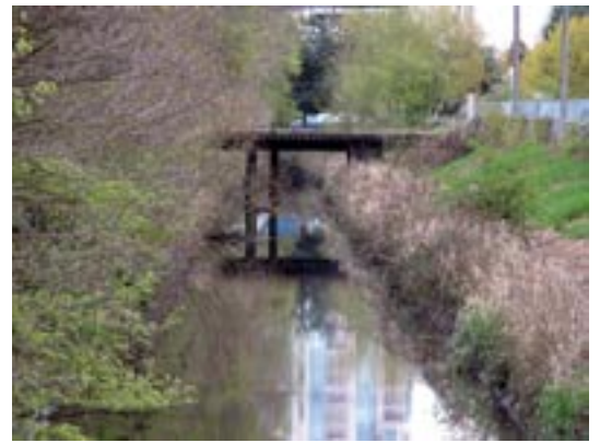
Hollybridge Way drainage canal