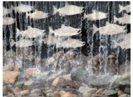
Functional and aesthetic