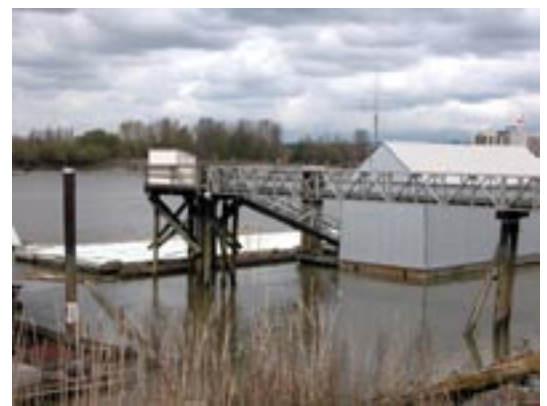
Future site of UBC Rowing Club on Middle Arm