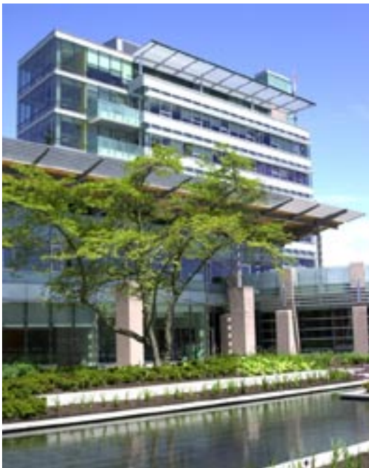
City Hall water feature (Westminster Hwy. side)