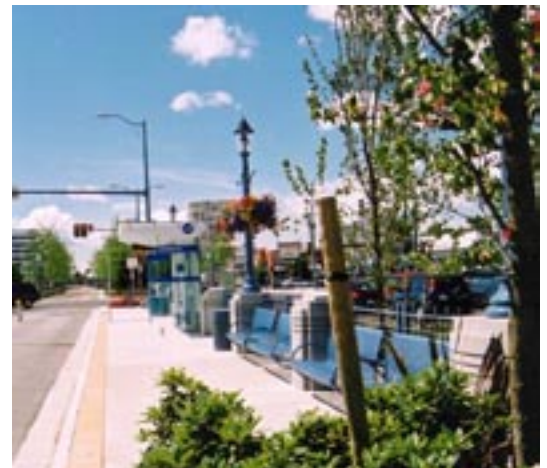
No. 3 Road Translink B-Line station