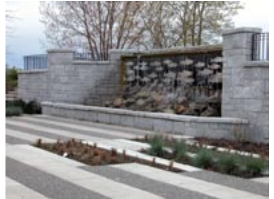
Hollybridge Way pump station