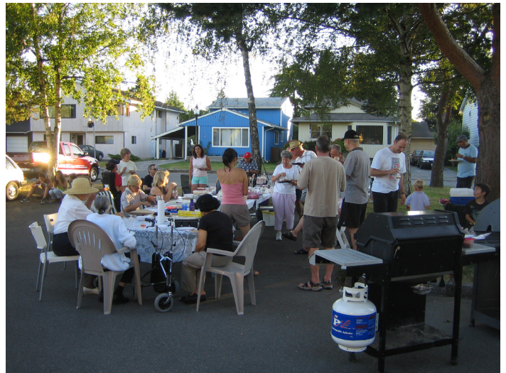
Frigate Court's 2006 summer Block Watch party.