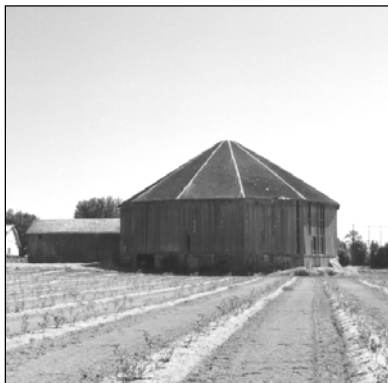
Ewen Barn is a national historic site