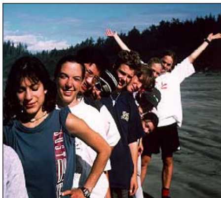
Richmond's youth are active and involved