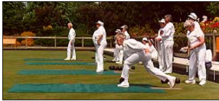
Seniors are a growing part of the community