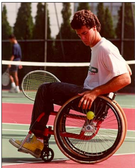
Richmond promotes participation by all