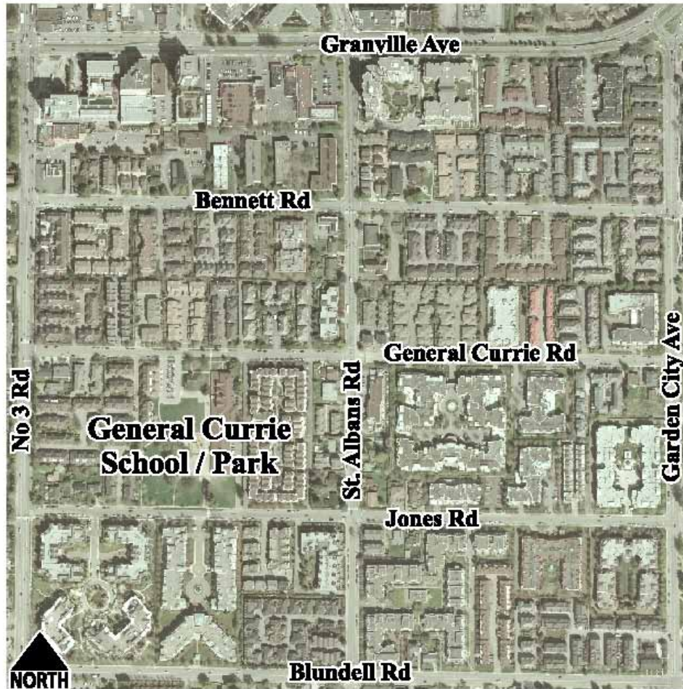
Figure 1: General Currie School Location