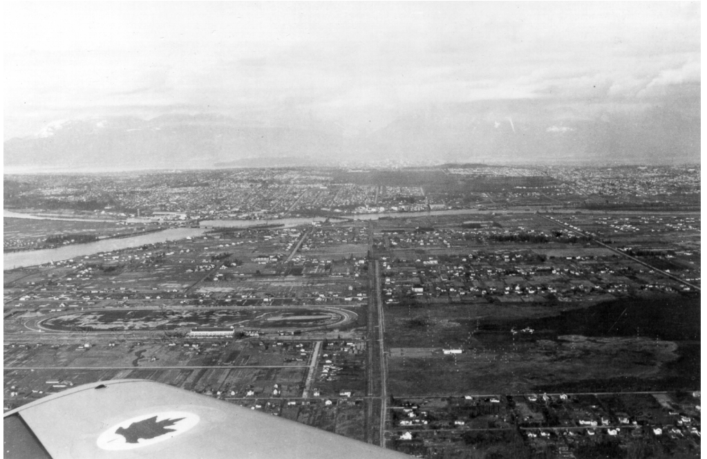
Ernest Chan took this photograph during a training mission in the skies over Richmond in the early 1950's. The oval in the left of the picture is Lansdowne Track. The road running north and south at the middle is Garden City. The North Shore Mountains are barely visible through the mist and cloud to the north.