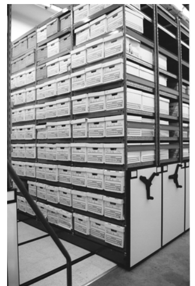
This is filing on a grand scale!

And what does this have to do with the Archives? When these files reach a certain age and value, some are transferred to the Archives where they become part of the documentary heritage of the community.