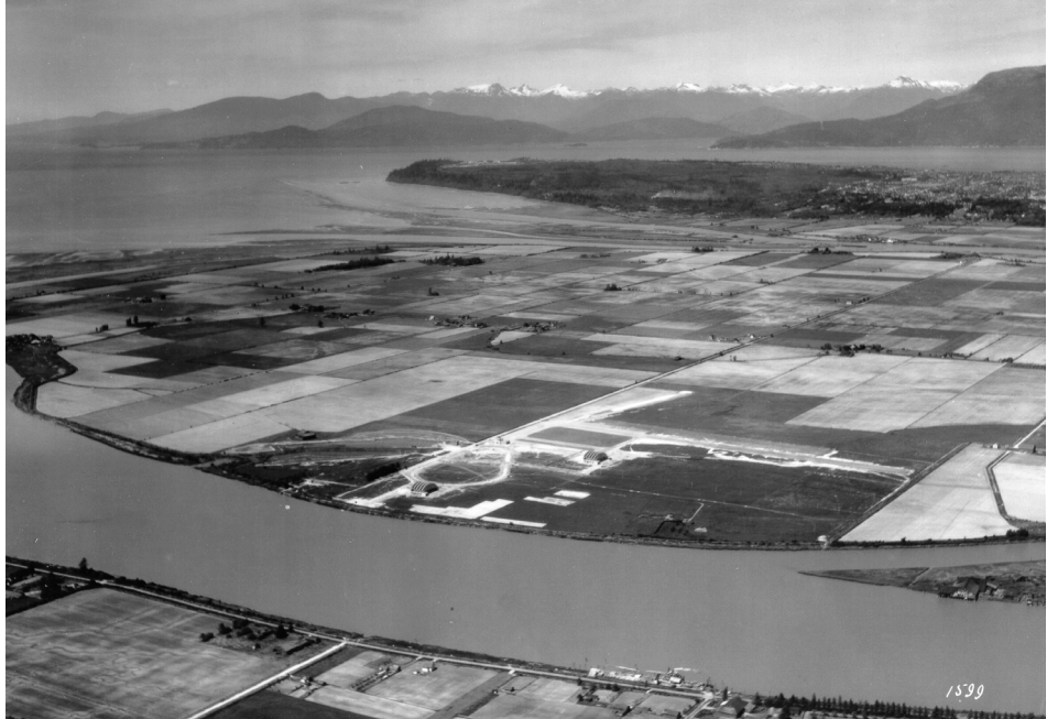
Aerial view of Sea Island and part of the Middle Arm of the Fraser River, circa 1940.