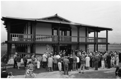
Opening of Minoru Sports Pavilion, 1964