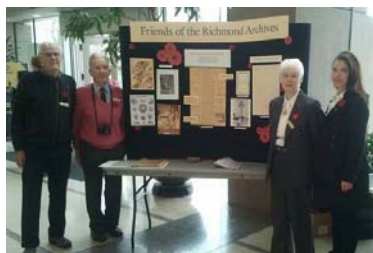
Friends’ exhibit at the Remembrance Day reception.

The Friends of the Richmond Archives were once again proud to have been invited to participate in this year’s Remembrance Day reception at City Hall.