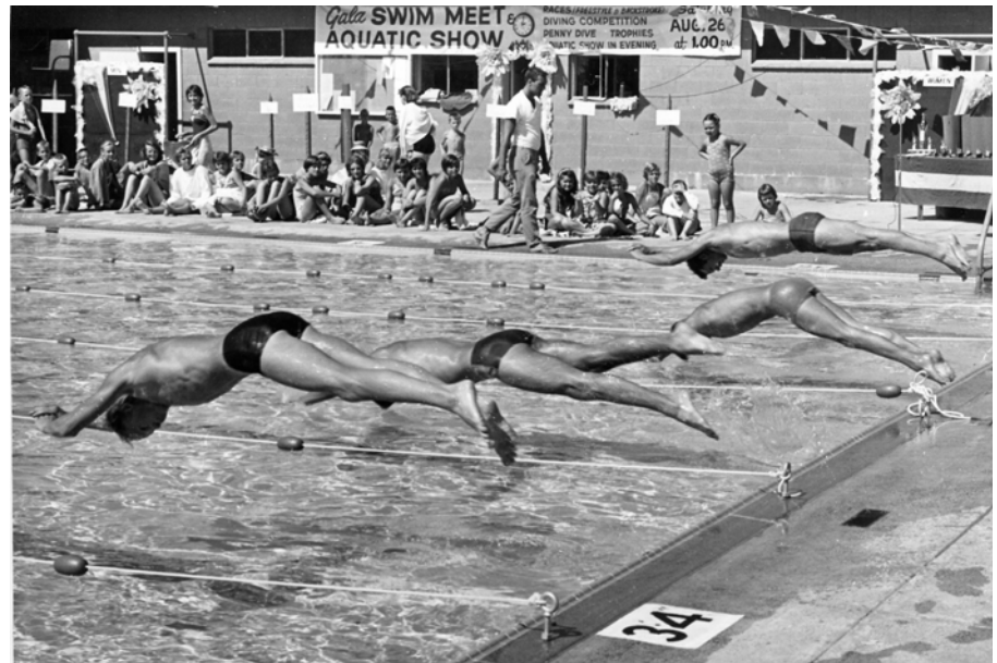
Swim meet at Centennial Pool, 1963

The City of Richmond Archives holds records documenting the growth of recreational opportunities in Richmond, including minutes of the Parks and Recreation Commission, bylaws and bylaw files relating to park acquisition and the building and maintenance of facilities, administrative and operational records of the early Recreation Department and the later Leisure Services Department, records of the Richmond School Board, and records of community associations and cultural and sports groups affiliated with the Commission.