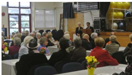
Archives Tea, 2013.

A receipt for income tax purposes will be issued for donations over $10.