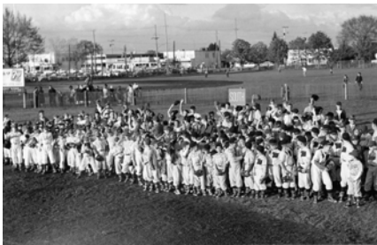
Little League tournament at Brighthouse Park, 1961