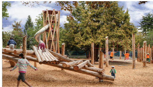
Terra Nova Play Experience