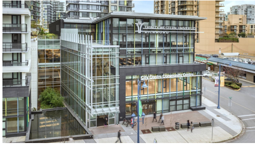
Quintet—City Centre Community Centre and Trinity Western University