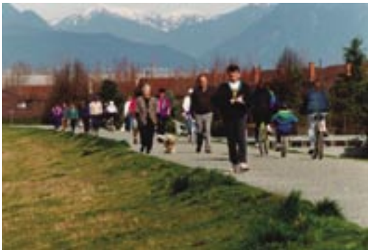
West Dyke Trail - near Garry Point Park