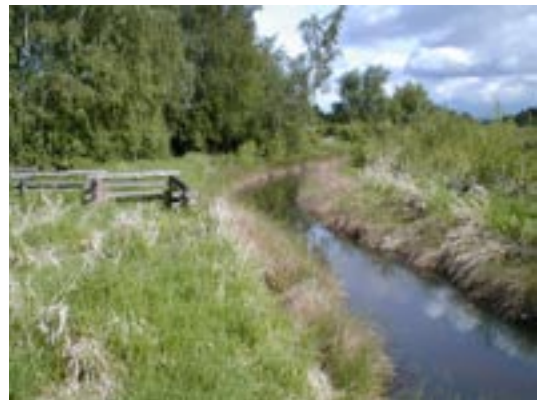
Terra Nova Natural Area