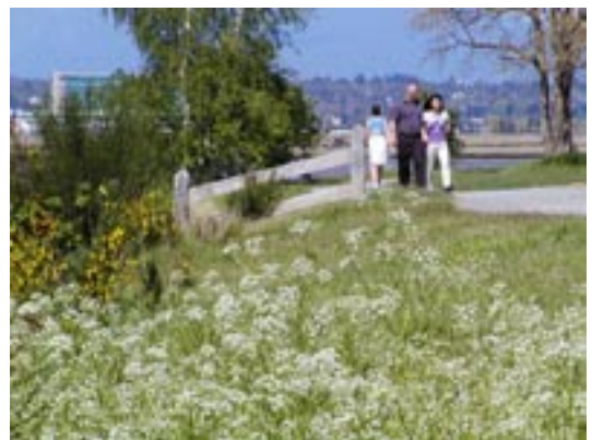
West Dyke Trail - north end