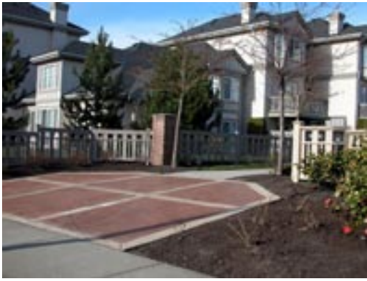
Terra Nova walkway