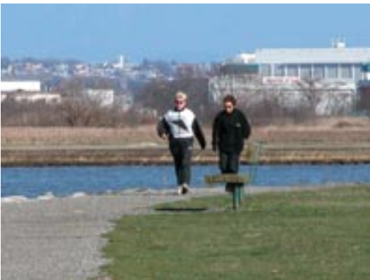
View of Sea Island and Vancouver International Airport from Middle Arm Trail