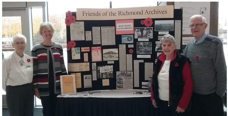
Friends of the Richmond Archives Remembrance Day exhibit at City Hall reception on November 11, 2017.