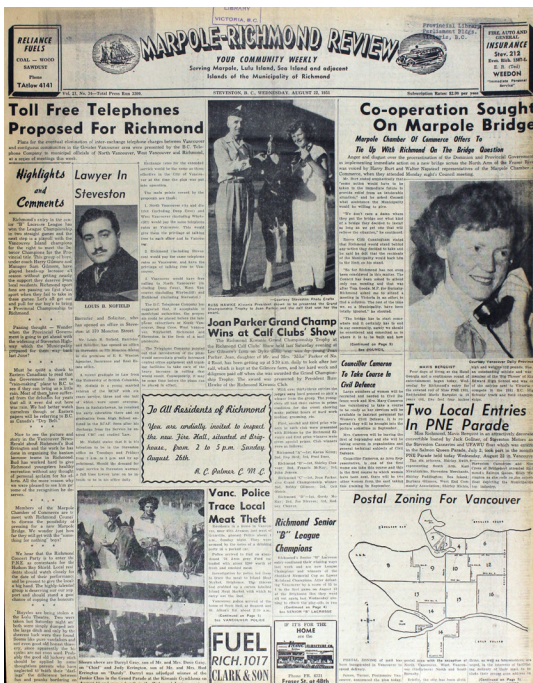
Cover page of the Marpole-Richmond Review , August 22, 1951.