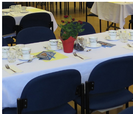
Tables at the Archives Tea set with white tablecloths, teacups and saucers, and decorated with potted tea roses on October 13, 2017.