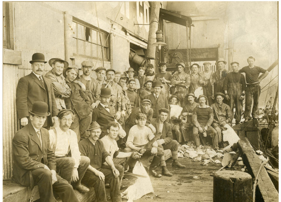
Dock workers and the crew of the fishing trawler Flamingo , ca. 1915.

If you can identify someone in this photo, please help out the City of Richmond Archives by contacting archives@richmond.ca or 604-247-8305. To find out who has been identified, please check on the Friends of the Richmond Archives' Facebook page; it will also be published in the next Archives News .