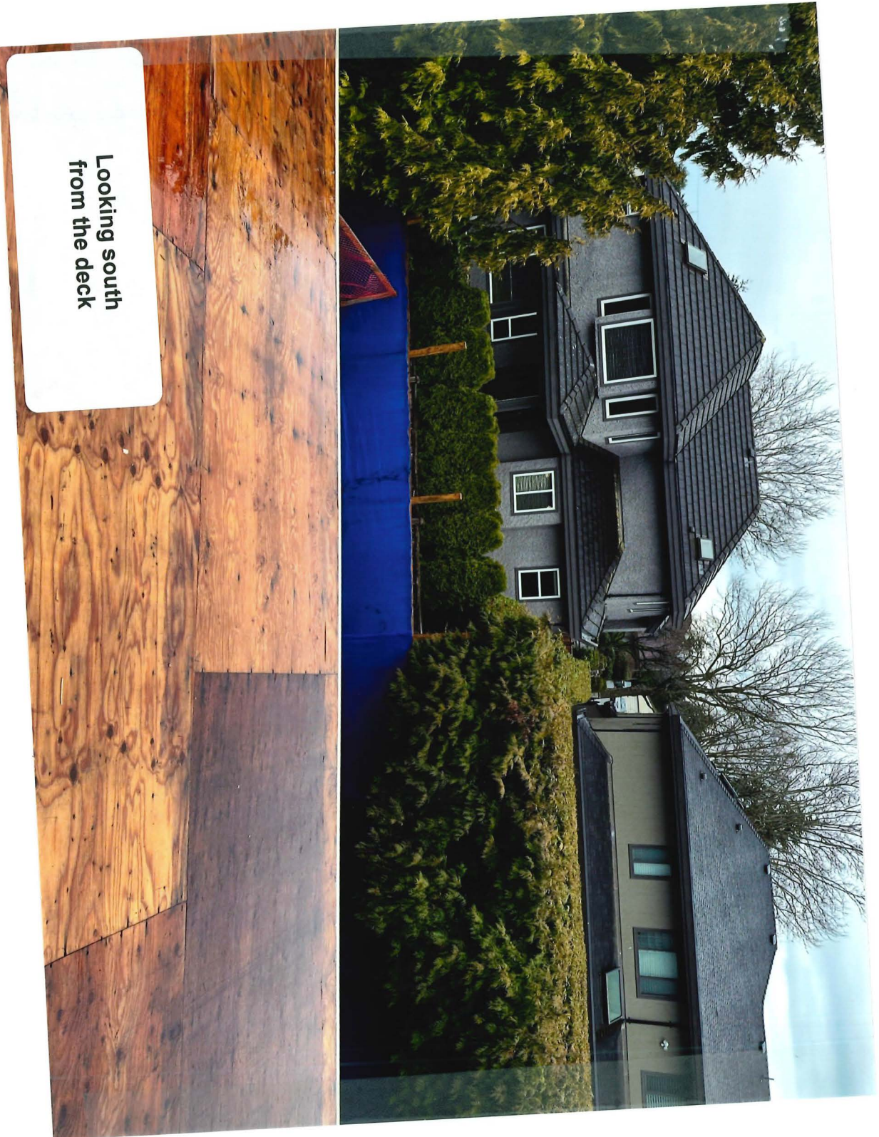
Looking south from the deck