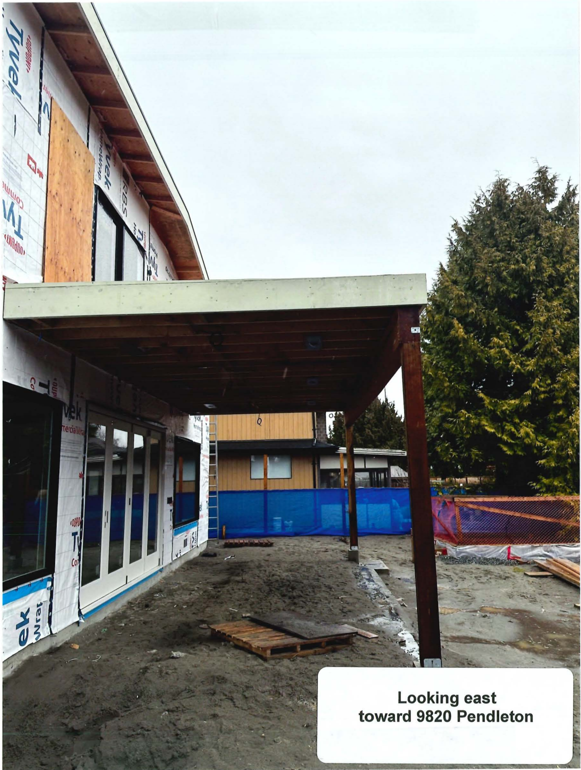
Looking east toward 9820 Pendleton