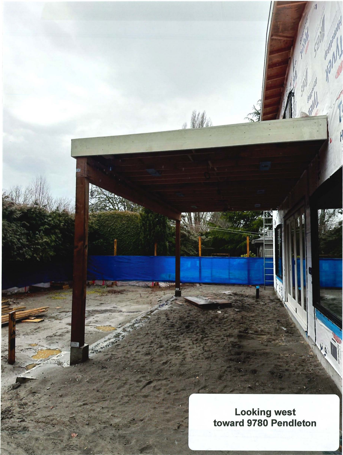
Looking west toward 9780 Pendleton