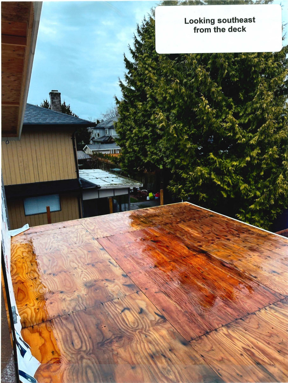
Looking southeast from the deck