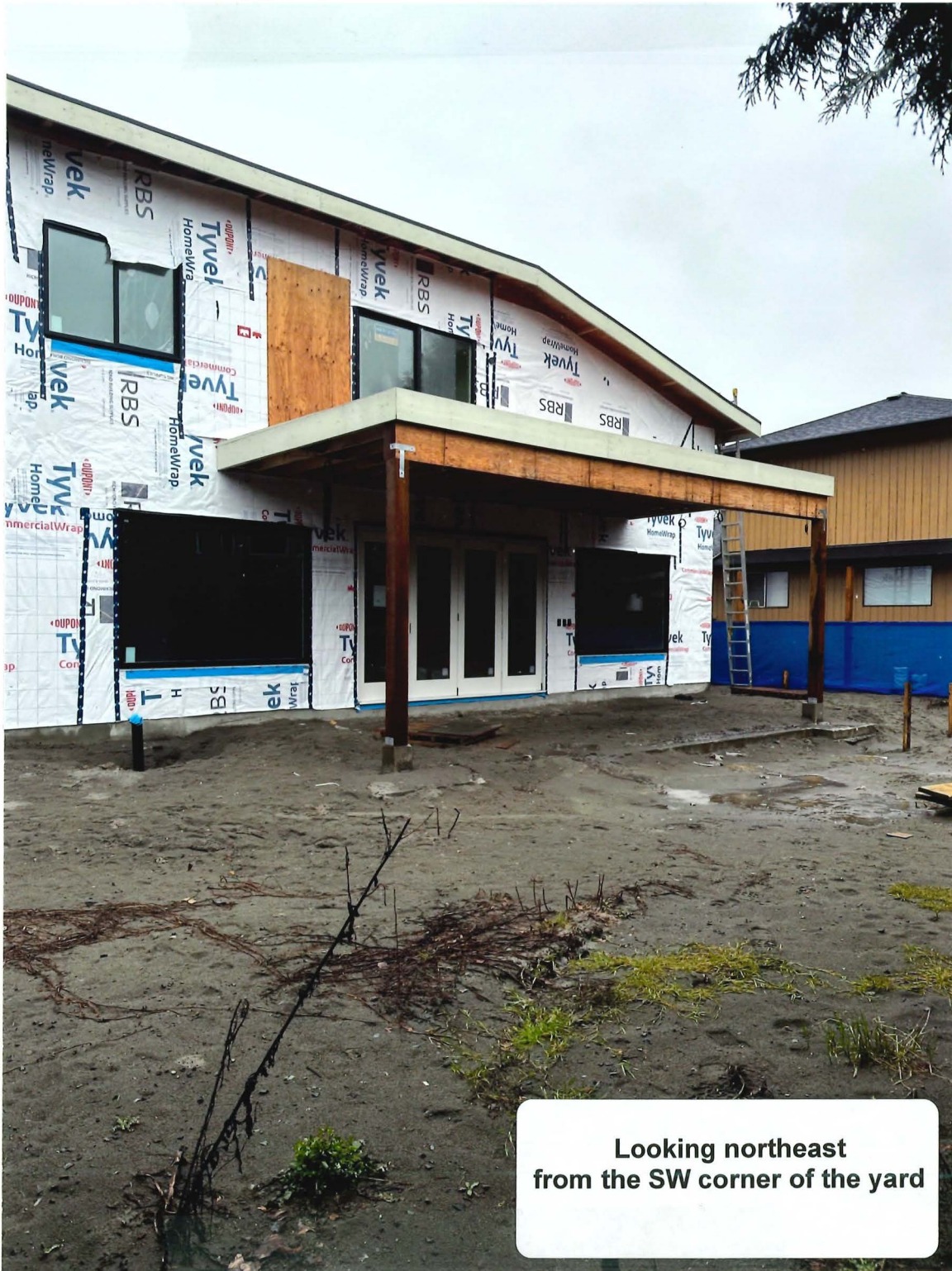
Looking northeast from the SW corner of the yard