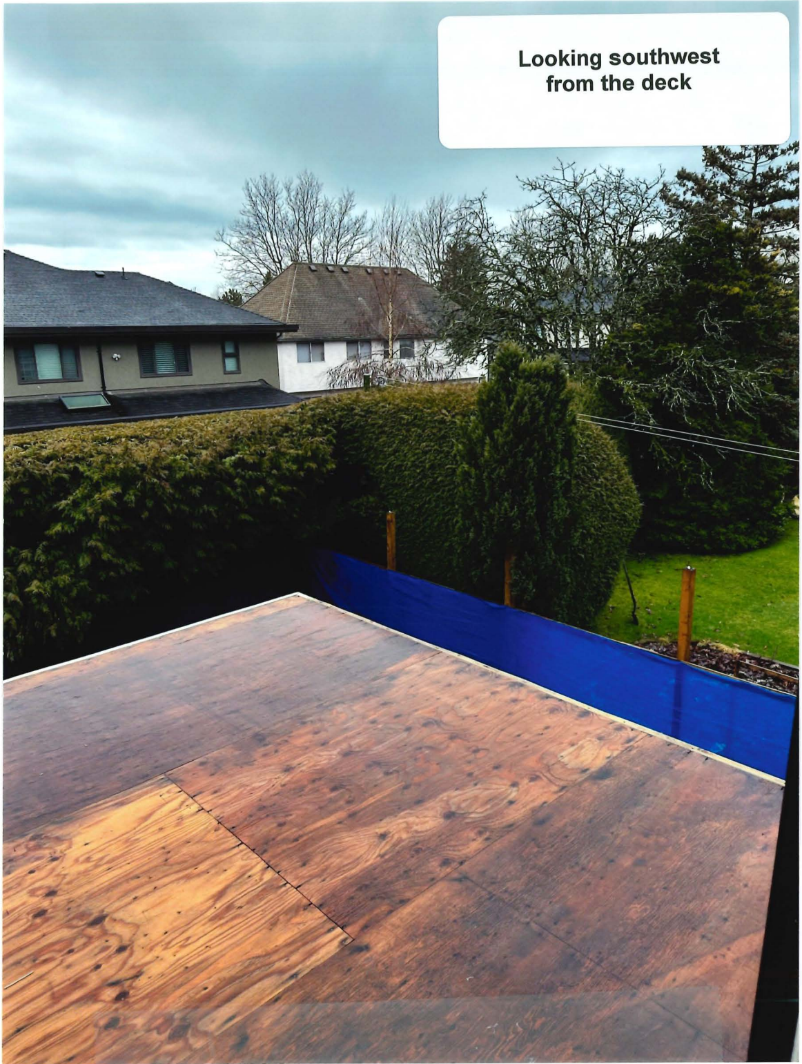
Looking southwest from the deck