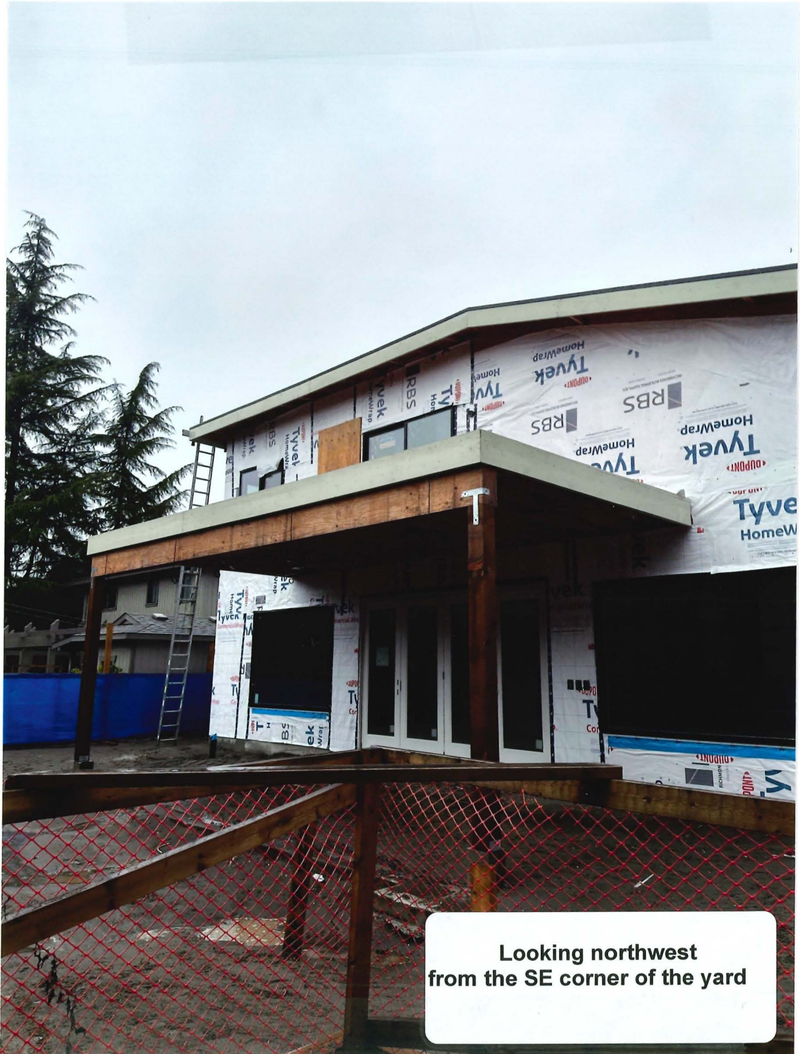
Looking northwest from the SE corner of the yard