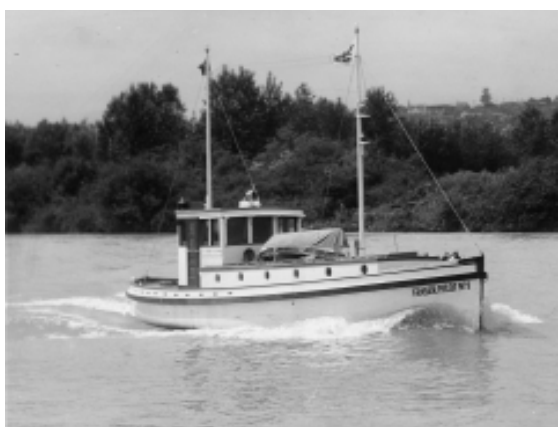
Fraser Pilot No. 1, at the time of its maiden voyage in July, 1937.

██████████ Richmond Farms trucks lined up, circa 1960.