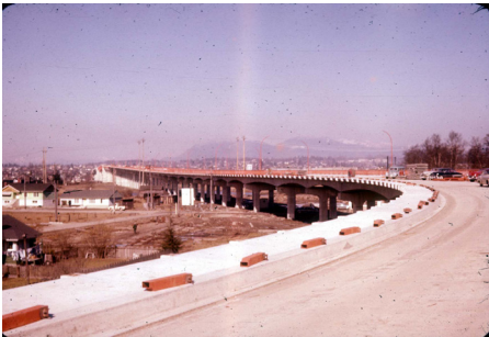
Oak Street Bridge construction, March 1957, 1957.