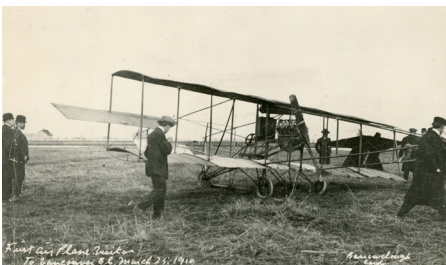
First airplane visitor to Vancouver B.C. lands in Minoru Park, 1910.