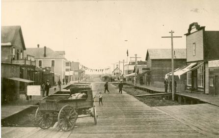
Steveston, [1891] or [1895].

A publication of the City of Richmond Archives Fall 2017 | Volume 22, Number 2