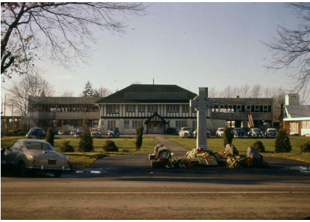
New Richmond Municipal Hall under construction behind the old Richmond Municipal Hall, shown in the foreground, ca. 1957.

City of Richmond Archives, photograph #1997 42 3 47.