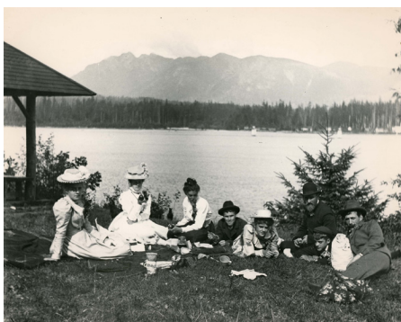
Picnic in Stanley Park, [ca. 1910].