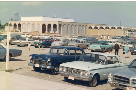
Richmond Arts Centre, ca. 1967.