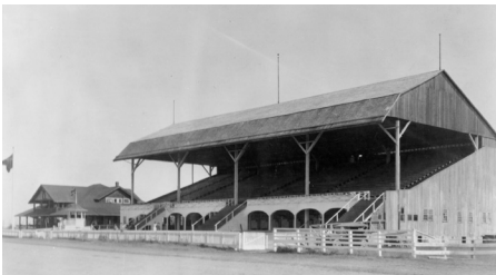
Minoru Park Racetrack, [ca. 1910].