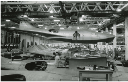
Boeing Plant on Sea Island, 1942.