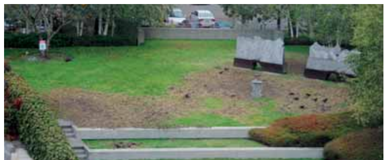
The major damage to lawns occurs when crows, skunks and other animals dig up the lawn in search of these large, chafer grubs between fall and early spring.

Monitor your lawn for chafer grubs by cutting a 30 by 30 cm square of sod and fold back to count the chafer grubs underneath. Cut 5 sections per lawn. Search through soil beneath the grass. Chafer control is recommended if you find more than 5-10 grubs per section.