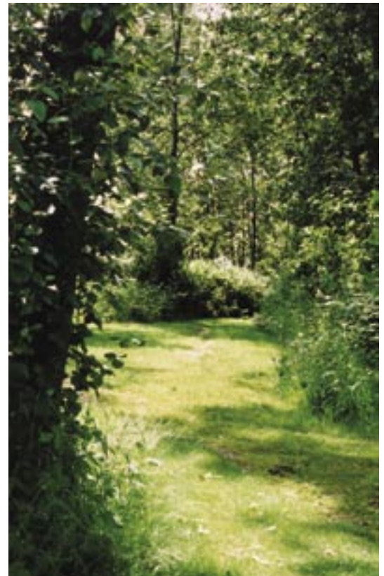
No. 7 Road Pier / Park