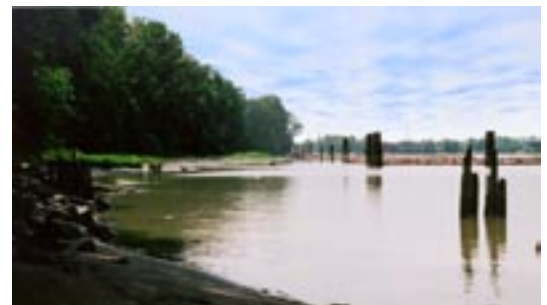
North Arm Fraser River