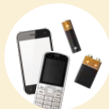
Cell phones and batteries