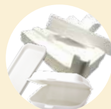
Polystyrene foam (e.g. Styrofoam)