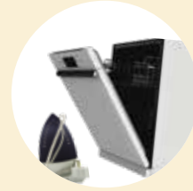
Large and small appliances