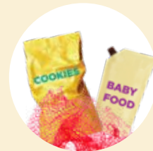
Flexible plastic packaging