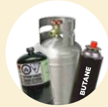
Propane tanks and butane cylinders/canisters