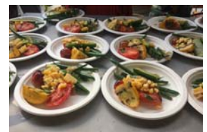
Seasonal Kitchen Workshop