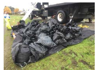
84 Bags of Brazilian Elodea removed