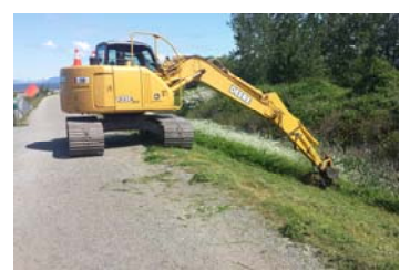
Wild chervil mowing trials along West Dyke