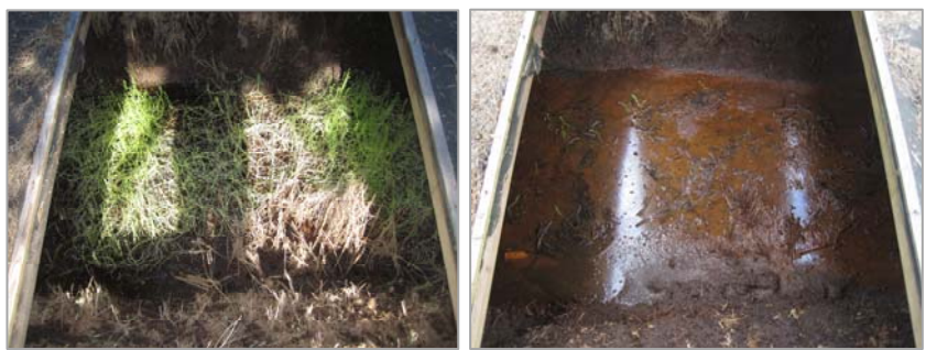
June 28, 2017