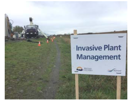
Partnership with the Province of BC on Brazilian Elodea removal