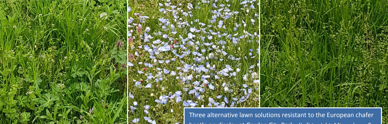
Three alternative lawn solutions resistant to the European chafer beetle on display at Garden City Park. (Left to right: Micro clover & tall fescue, Fleur de Lawn, Pollinator blend)