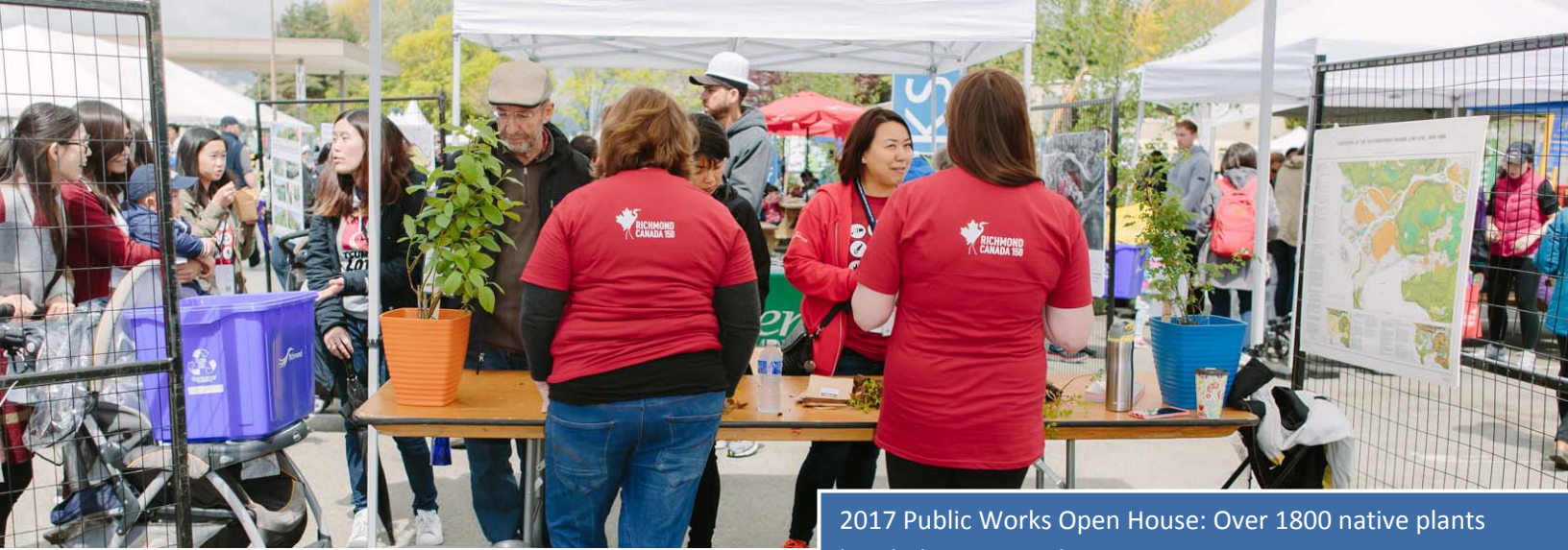
2017 Public Works Open House: Over 1800 native plants handed out to residents.