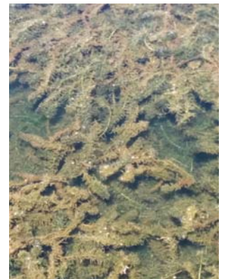
Brazilian Elodea in Steveston Slough, West Dyke