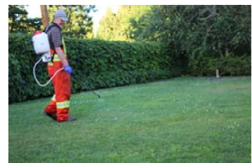
Nematode application at City Hall Plaza

261 knotweed sites treated totaling 2.5 ha