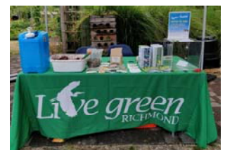
2017 Raptor Festival

residents engaged in environmental workshops since 2016