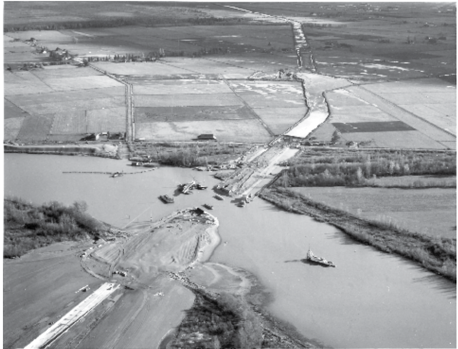
City of Richmond Archives photograph 1984 3 1, taken in 1958, shows the construction of the freeway just south of the George Massey Tunnel. The photo is on page 149.