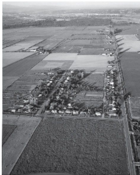
taken in 1977, shows the Kartner subdivision with Westminister Highway at the right.