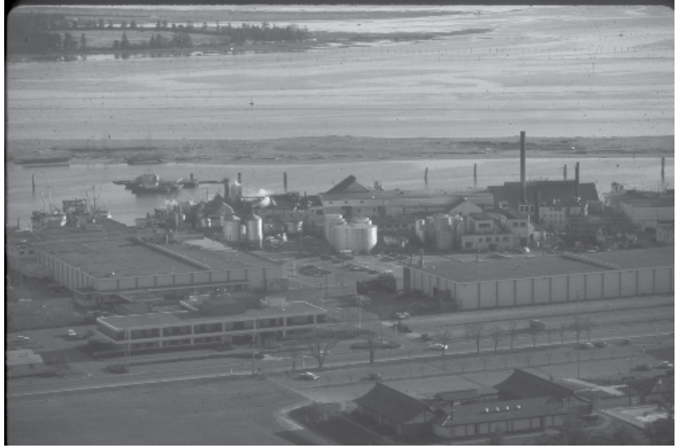
Photograph 2, taken in 1980, looks south from the Japanese Cultural Centre and B.C. Packers head office in Steveston towards the Fraser River.