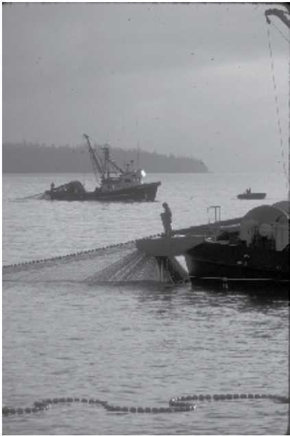
Photograph 22 in the series shows the intricate pattern of nets and corklines in the herring fishery. This image was featured in the exhibit brochure. The photographs will be on exhibit at the Archives Reference Room this year.