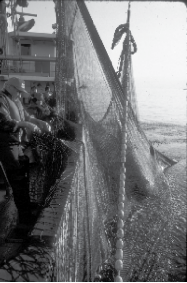
Photograph 28 - Drying up the set. The crew tries to control the net filled with 100 tons of roe herring.